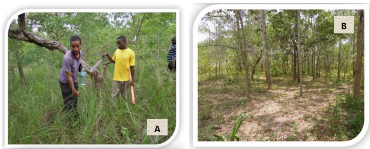
Figure 2. Variation in grassy cover between fenced plots (A) and unfenced plot (B): Photo: Pentti Niemisto (2007).