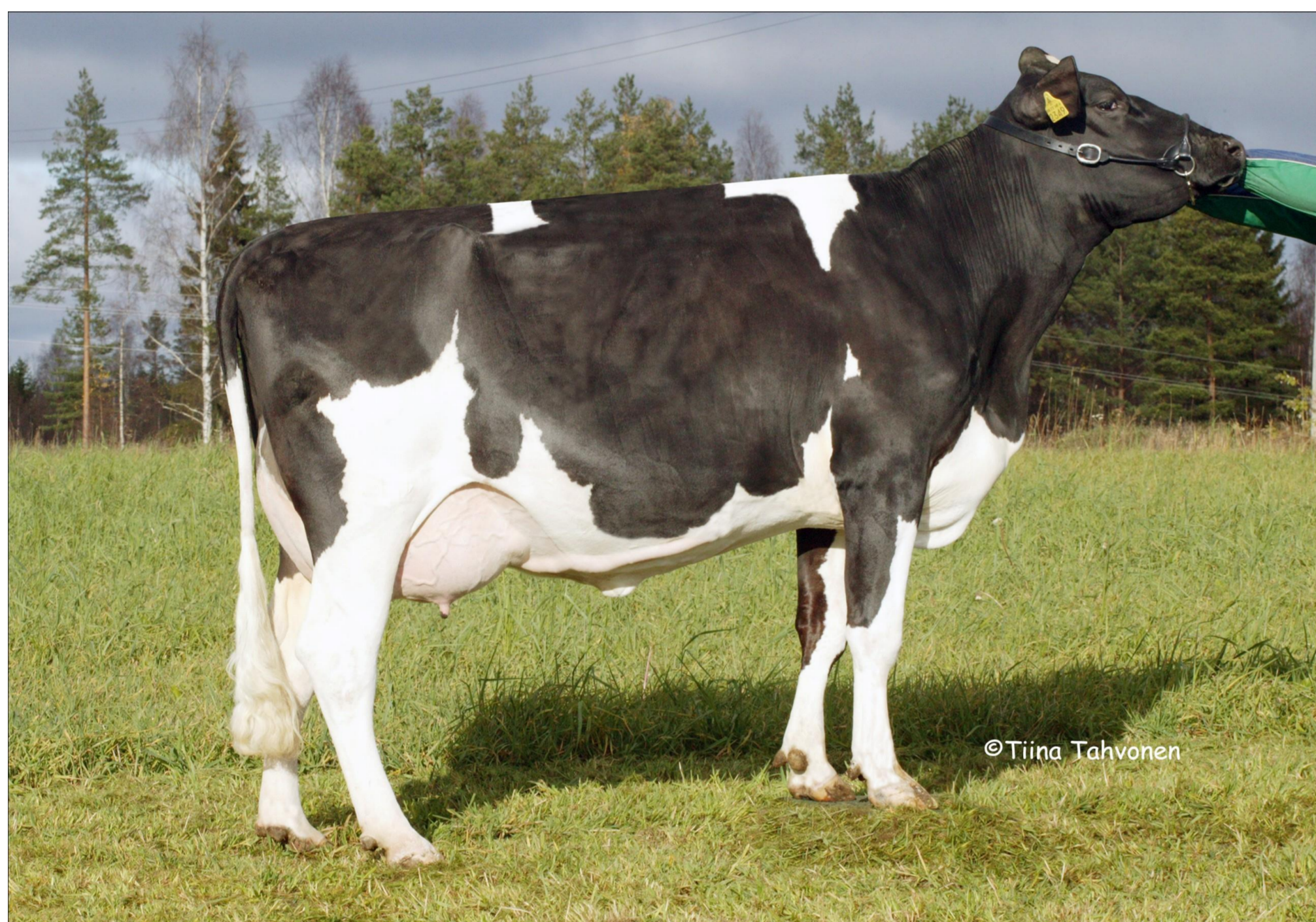
Figure 2. A Holstein dairy cow.