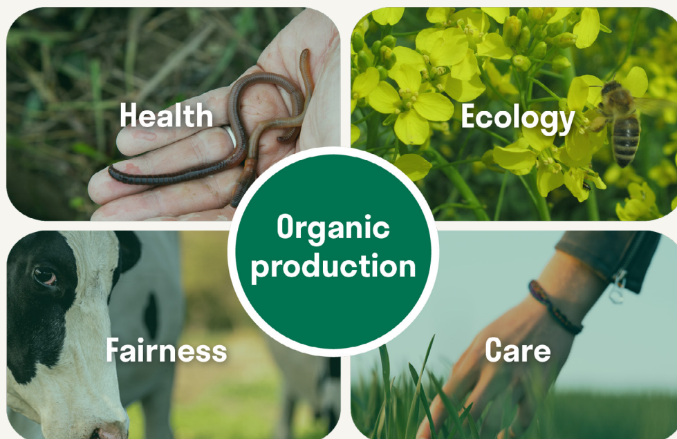
Figure 2. Ecological, social and financial sustainability form the philosophical basis of organic production. This overall sustainability is based on four main principles: health, ecology, fairness and care.

Organic production is based on the four principles put forth by the International Federation of Organic Agricultural Movements (IFOAM) (2024). These are: health, ecology, fairness and care (Figure 2). The aim is production of sufficient amounts of high-quality food that is fairly produced and takes into account the welfare of people, livestock, crops and the environment. In Finland, Rajala (2006) has listed the principles of organic production.