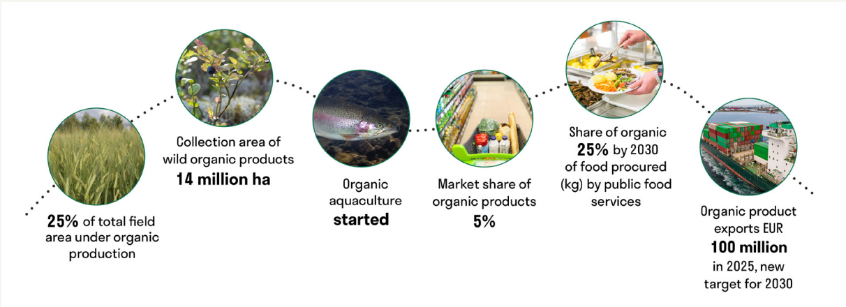
Figure 1. Organic 2.0 – Objectives of Finland’s National Programme for Organic Production by 2030 (MMM 2023a,b).

These research priorities have been prepared in close cooperation with members of the organic food and farming sector. An online survey was conducted in early 2024, which was responded to by 37 representatives of organic companies, farmers, advisors, researchers, the authorities and the organic sector’s other members.