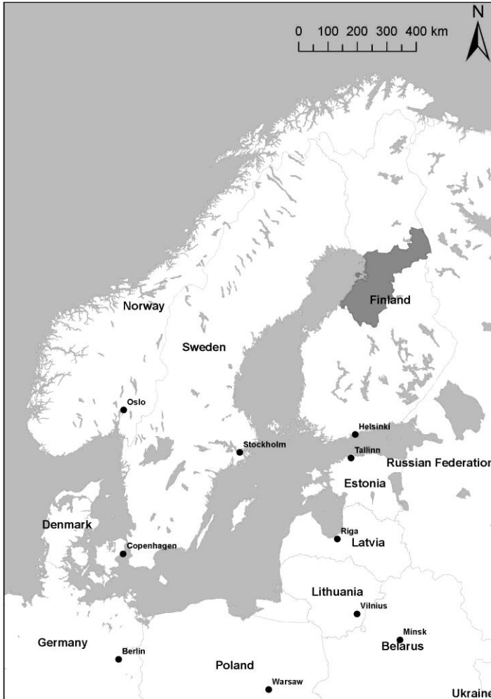
Figure 1. Location of the research area, Northern Ostrobothnia, in North Europe.

Agriculture and the food industry have a significant impact on the regional economy in Northern Ostrobothnia. Northern Ostrobothnia is also a nationally important agricultural region, although the cold weather and northern growing conditions limit the cultivation of bread cereals, for example. On the other hand, the region is home to Finland's only high-grade seed potato production area (SPK 2023).