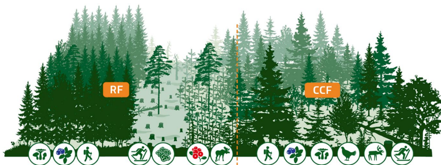
Fig. 10.5 The infographic shows how CCF favours most recreational uses while RF is suitable for at different stages. The situation also varies according to the season, as e.g. the cross-country skiing experience does not suffer from clearcuts whereas for false morels clearcuts are almost necessary

positioning. Wider use of participatory methods would also bring more understanding of the needs of different user groups.