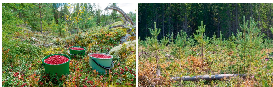
Fig. 10.1 Lingonberry benefits from the availability of light in young stands at the seedling stage and may produce good yields in such forests

Unlike bilberry, lingonberry does not thrive in shady habitats, so the best berry yields occur after regeneration and final fellings under RF. Eventually however, under RF, there will be a reduction in surface area coverage and productivity as the forest grows and less light is available (Turtiainen et al. 2013). Nonetheless,