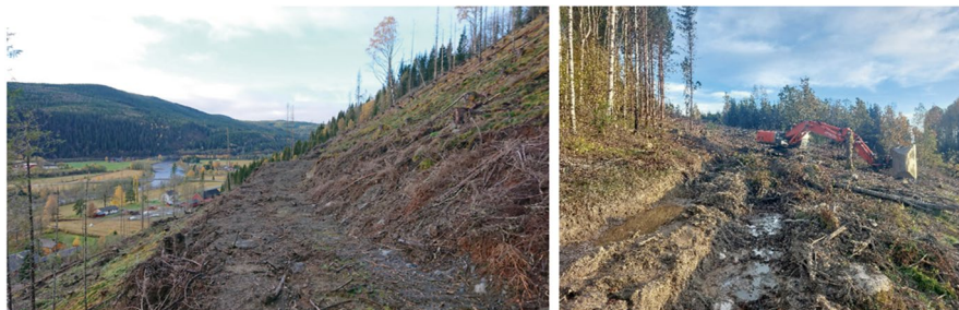
Fig. 10.3 Left excavator roads without drainage commonly used in Norwegian clearcuts on slopes contribute to water channelling and flow accumulation in new parts of the slopes. Right. Wheel tracks left by heavy forwarders used in clearcutting can channel water and accelerate erosion downslope. While these channels are frequently repaired by excavators following forest operations, such repairs primarily serve an aesthetic purpose as significant soil compaction has taken place. CCF does not promote temporary machine access for large volumes of wood, therefore the potential to prevent some of these problems is significant