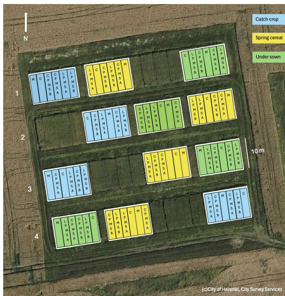
Fig. 1. Experimental set-up with four replicate blocks (1–4), crop type as a main plot factor, and fertilisation treatment as a subplot factor. CPMS = composted pulp mill sludge, LPMS = lime-stabilised pulp mill sludge, A = Stora Enso Imatra mill, B = UPM Lappeenranta mill, C = Control, no fertilisation, M = Mineral fertiliser. Catch crop = catch crop Italian ryegrass after spring cereal, Spring cereal = spring cereal alone, Under sown = spring cereal undersown with Italian ryegrass

The field experiment was a factorial design with crop type as the main plot factor and fertiliser treatment as the subplot factor (Fig. 1). The three levels of the main plot factor were spring cereals alone, spring cereals under-sown with Italian ryegrass ( Lolium multiflorum , variety 'Meroa,' Departement voor lantengenetica en veredeling, Melle, Belgium) and Italian ryegrass as a catch crop (Fig. 1).