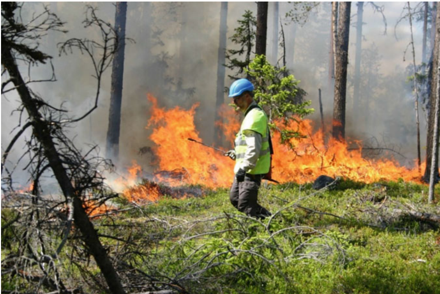
Fig. 18.2 Prescribed burn of a forest stand as part of an ecological restoration experiment in Sweden (see e.g., Hägglund et al., 2020; Hjältén et al., 2017; Versluijs et al., 2017)

Prescribed burning of clear-cut areas is a traditional management method in forestry in Fennoscandia (Fig. 18.2). Its primary purpose is to modify soil properties and promote the establishment of a new tree cohort; however, the method was abandoned because of pest- and pathogen-related damage and high labor costs. Therefore, this technique was replaced by mechanical site preparation methods (Löf et al., 2015). Methods of prescribed burning for ecological restoration vary and involve different levels of tree retention. A few recent experiments have explored the effects of prescribed burning on biodiversity patterns. Most of these studies have included various types or intensities of tree harvests combined with prescribed burns; however, some studies also included comparisons with other restoration methods. The consequences of prescribed burns have been monitored, at least, for birds, beetles and other invertebrates, wood-associated and other macrofungi, vascular plants, bryophytes and lichens, and tree seedlings. The treated forest stands typically cover 2 to 25 ha and can be regarded as large-scale experiments in a Fennoscandian context.