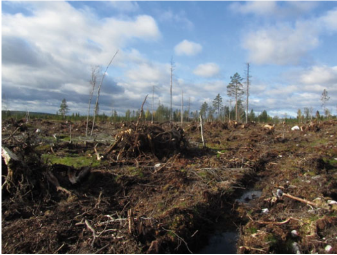
Fig. 18.1 Forest stand subjected to clear-felling and stump harvest.

Jonsson et al., 2005; Kouki & Salo, 2020; Kuuluvainen, 2009; Paillet et al., 2010; Siitonen, 2001; Stenbacka et al., 2010). Forests are the most important habitat for red-listed and threatened species in Sweden and Finland. In Finland, 32% (2,133 species) of red-listed species are forest dwelling (Hyvärinen et al., 2019). Similarly, 43% (2,041 species) of the red-listed species in Sweden are forest dwelling (Artdatabanken, 2020). The species most negatively affected by silviculture are old-growth specialists dependent on a long forest continuity and old trees and species associated with deciduous trees (Artdatabanken, 2020; Bernes, 2011; Hyvärinen et al., 2019). Efforts to mitigate these adverse effects on biodiversity have been introduced to limit the harmful effects of the prevailing forestry practices on species and habitats.