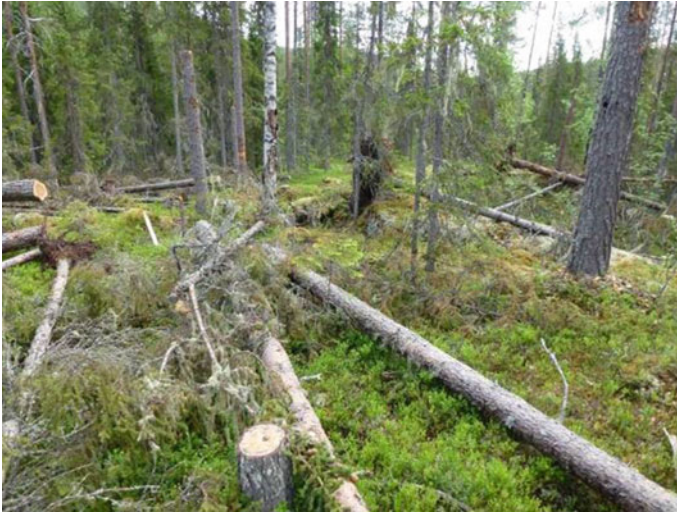
Fig. 18.4 Gap cutting includes creating deadwood as part of an ecological restoration experiment in Sweden (see e.g., Hägglund et al., 2020; Hjältén et al., 2017; Versluijs et al., 2017)

combined effect of too-small gaps to attract open-area or edge specialists and a lack of response in the understory vegetation. Forsman et al. (2013), studying larger gaps, also did not find any general effect of gap disturbance on the overall abundance and richness of boreal-forest bird species. This could suggest that organisms such as birds that have larger home ranges, a larger spatial scale must be considered for restoration efforts and subsequent assessment (Hof & Hjältén, 2018).