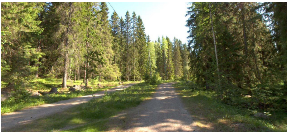
Figure 1 The mindfulness exercise on appointment 1 was held in a riverside environment (A), the conscious walking exercise on appointment 2 in a park next to a natural pond (B) and the favorite place exercise on appointment 6 in a recreational forest (C).

On the first appointment in May (Thursday) the participants were given an introduction lecture about health and well-being benefits of exposure to natural environments (30 min) and instructions to give the saliva samples (15 min). First saliva samples for \alpha -amylase analysis were collected (15 min). A mindfulness exercise (15 min) was done after a short walk (5 min) standing still on a riverside recreation area (Figure 1A) immediately near the water, followed immediately