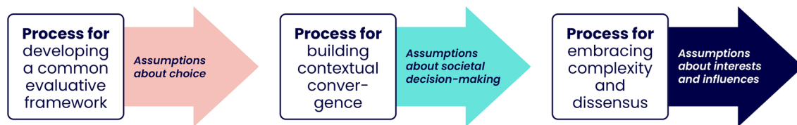
Fig. 1 Three strategies forming a gradient for managing tensions between thought collectives and their respective assumptions