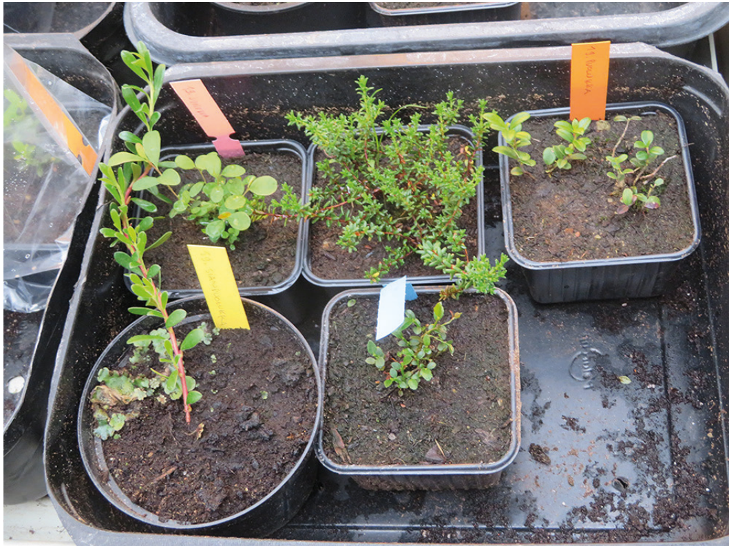
Fig. 2. Test plants inoculated in the greenhouse.