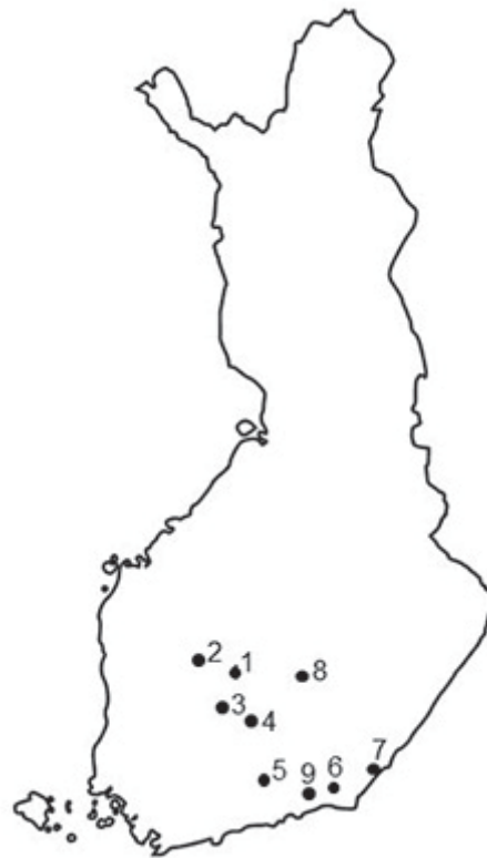
Fig. 1. Locations of the Norway spruce seed orchards in southern Finland. 1 = Heinämäki (no. 170; 62°13'N, 25°24'E), 2 = Metsä-Ihala (no. 176; 62°12'N, 24°07'E), 3 = Riihimäki (no. 169; 61°53'N, 24°52'E), 4 = Paronen (no. 365; 61°39'N, 26°17'E), 5 = Sillanpää (no. 235; 60°55'N, 26°13'E), 6 = Taavetti (no. 428; 60°56'N, 27°35'E), 7 = Imatra (no. 374; 61°09'N, 28°47'E), 8 = Suhola (no. 403; 62°15'N, 27°42'E) and 9 = Palvaanjärvi (no. 172; 60°48'N, 27°29'E).

1 2 3 4 5 6 7 8 9 10 11 12 13 14 15 16 17 18 19 20 21 22 23 24 25 26 27 28 29 30 31 32 33 34