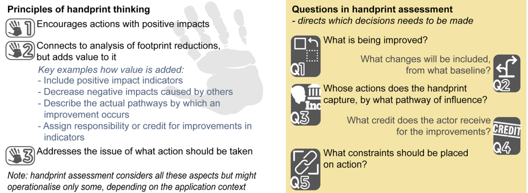
Figure 1. Defining principles of handprint thinking (HP1–HP3, section 3.1) and decisions in handprint assessment, expressed as questions (discussed in section 3.2).

should be situated in that intersection, combining actor-specific targets and systemic understanding of issue setting with comparable metrics when possible.