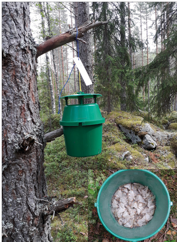
Fig. 2. The type of pheromone trap used in the survey installed on a Scots pine. The nun moths are trapped in the lower container part of the trap (the zoomed image). In the image, the typical black-white colouring has been lost from the wings of the densely packed moths.

The traps were placed at a height of 1.5–3 meters from ground, which has been found to be optimal for pheromone trapping of this species (Skuhravy 1987; Wang et al. 2017). Total number of traps was 58 in 2018 (+ 13 glue-based traps) and 137 in 2019 (funnel traps only). Based on results from 2018 as well as from other studies (Hielscher and Engelmann 2012), the 2019 trapping was conducted predominantly between 10th of July and 30th of August. This is the main period