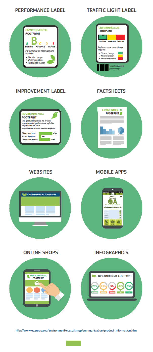
Figure 1. Examples of communication vehicles for business to consumer and Business to Business provided by the EU (Lupianez-Villanueva et al., 2018).