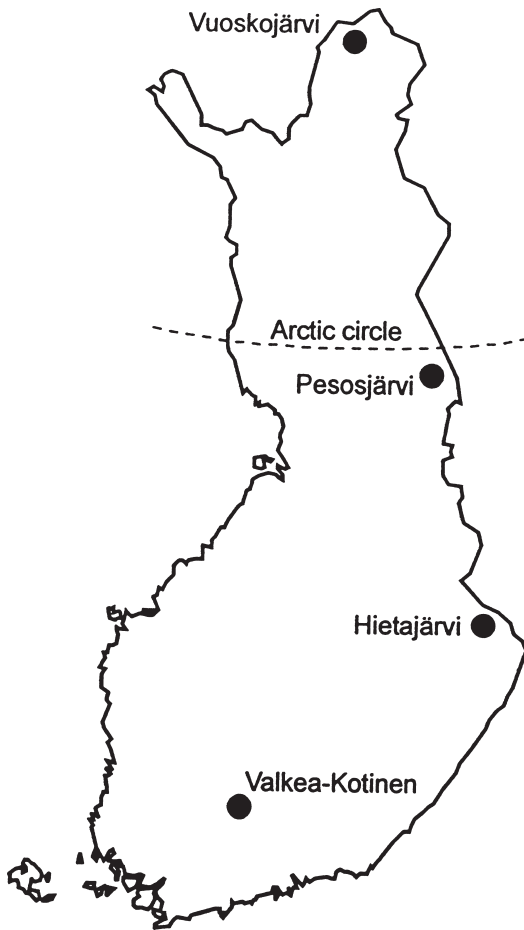
Fig. 1. Location of the study areas in Finland.

toring nutrient cycling via specific components of decomposition processes, such as the microbiological activity and microbial biomass in the soil, can serve as indicator of how ecosystems are affected by pollution stress.