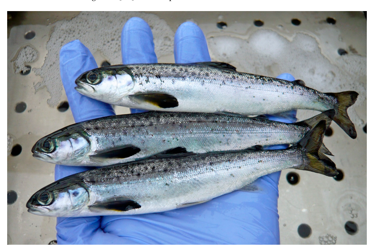
Figure 1. When smolting Atlantic salmon smolts become silvery and body-streamlined (Photo: River Tornionjoki (Finland) Atlantic salmon smolt, Ville Vähä).

In salmonids, genetic diversity combined with developmental flexibility leads to numerous pathways to residency, migration, or maturation [106], and especially among Pacific salmon, there are also other phenotypes than smolts out-migrating rivers [107,108]. Anadromous salmonid juveniles transform from parr to smolts to prepare for downstream migration and entry into seawater. Physiological and behavioral changes take place in the spring when juvenile salmonids undergo smolting. Smolting and smolt migration are considered critical life-history stages essential for survival [5]. While still in fresh water, fish undergo a preparatory smolting process involving morphological changes as they become silvery and streamlined [2] (Figure 1). Behavioral changes include decreasing rheotactic and optomotor sensitivities and fish's station-holding abilities [9]. The photoperiod and temperature regulate physiological changes via their impact on the neuroendocrine system [2]. Thus, because the photoperiod remains the same at the same date and site each year, the temperature will be critical in determining responses to future climate change. Within the same river system, the distance to the sea does not seem to play a role; populations are closer or further from the sea smolts at the same time [109,110]. Waterflow and its variability as another major environmental factor can act more as a timer to initiate migration [2,7], for example.