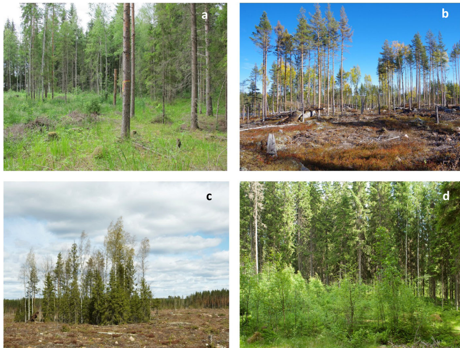
Fig. 3 Examples of retention experiments in Finland and Sweden. a Gap felling with 5% group retention inside a gap, spruce forest, third post-harvest summer. DISTDYN project in Finland. Photo: Matti Koivula. b In the Swedish experiment, Effaråsen, Scots pine stands have been harvested with retention levels varying from 3 to 100%. At each level the retention included equal proportions of intact green trees, girdled trees, high-cut trees, and felled trees. In the picture, a level of 30% retention is shown. Photo Line Djupström. c Retention tree group inside a clear-felled area. In the RETREE project, varying sized retention tree groups, 0.1–0.6 ha were left in a harvested area. Photo: Erkki Oksanen/LUKE. d . Naturally regenerated gap in the MONTA experiment 14 years after harvesting. Photo: Erkki Oksanen/LUKE. For more information on the experiments, see Table 2, and for their location, see Fig. 2.

organisms (bryophytes, lichens, fungi) is also evident in studies from this part of Northern Europe. The overview on large-scale, replicated retention experiments given here supplements earlier descriptions of experiments performed around the globe (Gustafsson et al. 2012). Results from the experiments are clear; substantial amounts of retention are needed to counteract negative effects of logging on species associated with old forest, agreeing with meta-analyses on retention forestry and biodiversity (e.g., Fedrowitz et al. 2014). In selection felling as well as gap felling, > 50% of stand volume needs to be retained in order to maintain common forest species, and retention patches need to be more than half a ha in size, and probably larger, to preserve old-forest species communities. Important mechanisms for the long-term survival of old-forest species include moist microclimate and availability of various microhabitats. Insights into restoration efforts have also been gained from the experiments; many saproxylic species benefit from addition of deadwood and prescribed burning, actions compatible with retention forestry.