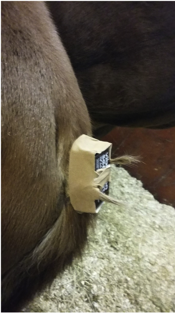
Figure 2. Accelerometer attached to a foal's tail using Leucoplast® tape to hold it in place.

removal of it by the mare. To prevent skin damage, accelerometers were attached to the hair of the tail and they were rechecked every 24 h during the whole in-hospital period with the HF. In the BSF, accelerometers were in place only during their shorter monitoring period and no extra recheck was needed. The 3DAs were positioned with positive z-axis pointing cranially, positive x-axis laterally, and positive y-axis vertically. The logger measured acceleration using \pm 16g measurement range with 100 Hz sampling frequency and recorded mean, maximum, and minimum acceleration of each axis in device memory in 5 second epochs based on pilot measurements (Pirinen et al., 2016) and sampling rate used in previous accelerometer studies (Hokkanen et al. 2011; Thompson et al., 2015). Continuous video recordings (MS-C2163-PN; Milesight, of 20 frames/second, USA) were used with the HF, as well as with the BSF (SJAM 1080P HD, of 30 frames/second, China). Cameras were attached to the wall of the stable of the HF, so that the foals were fully visible. With the BSF, the camera was hand-held or attached to the fence of the pasture for the whole monitoring time, such that in both cases the pasture was fully visible. The cameras and accelerometers were synchronized with a resolution of one second.