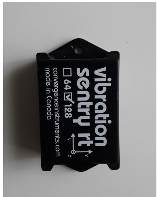
Figure 1. Accelerometer used in the study: Vibration Sentry E-16g; Convergence Instrument, Canada.

Acceleration was measured using a MEMS (micromachined microelectromechanical systems)-type 3DA (Vibration Sentry E-16g, Convergence Instrument, Canada, dimensions 7.62 \times 3.94 \times 2.06 cm) (Figure 1). The device was chosen because of its high memory capacity, which would make it suitable for long-term observations. The accelerometer was attached by one of the authors, an experienced veterinarian (NP), to the foal's tail using Leucoplast® tape to hold it in place (Figure 2). When the device was attached for the first time, the foal's behavior was monitored carefully to see if the foals or mares reacted to the device. Increased tail movements, looking at the tail direction, kicking, biting, or nervous behavior could have been a sign of discomfort for the foal. In cases of signs of discomfort, the device would have to be removed. The mares were also monitored, as they could potentially try to remove or bite the device. If the mares showed interest in the device (smelling, touching, repeatedly looking at the device or tail area), it would have to be removed to avoid possible violent