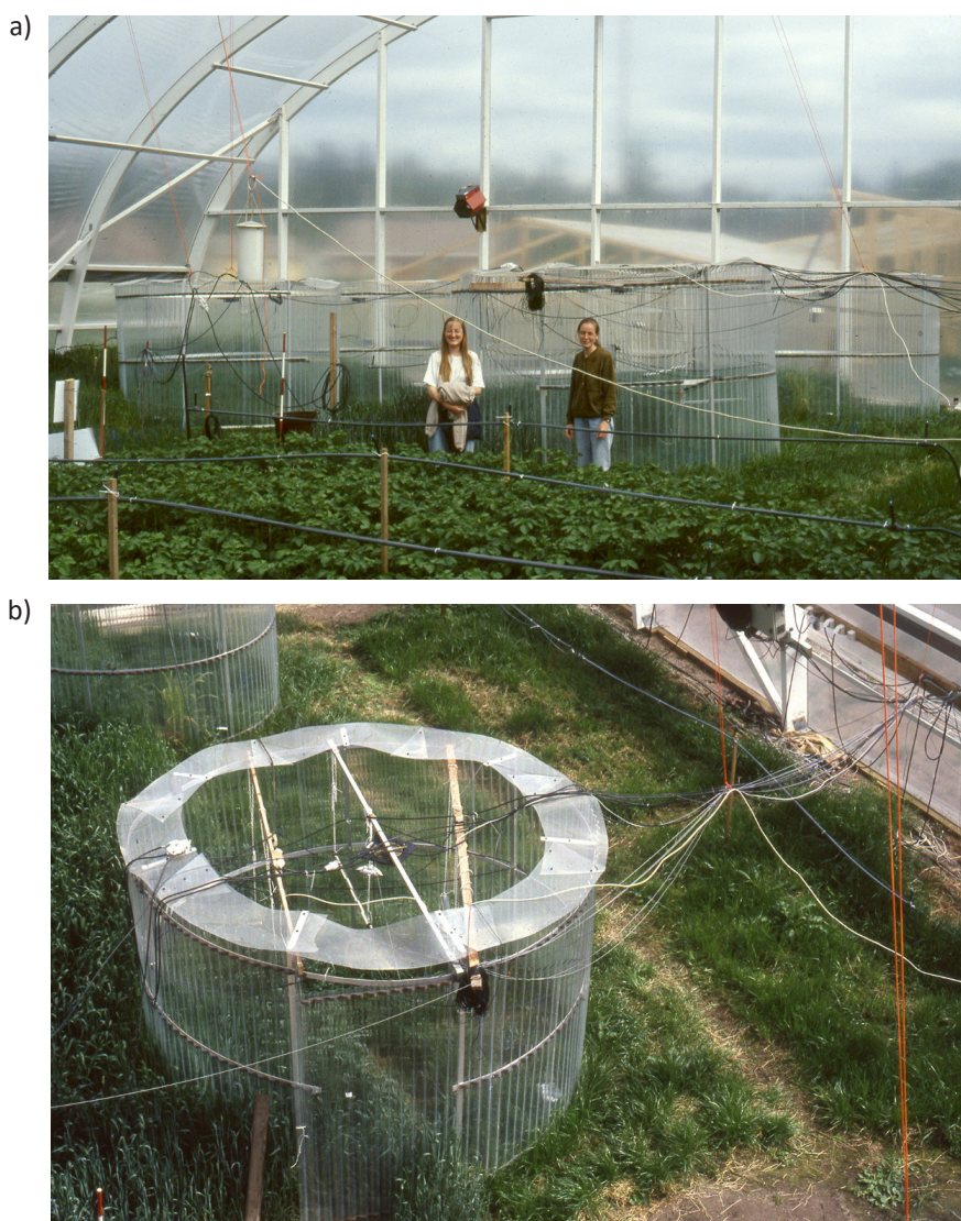
Fig. 2. a) OTCs in an automatic climate simulation system in MTT Jokioinen in 1993, b) OTCs were placed over fields with canopies of wheat and meadow fescue.

The funding was divided into five thematic groups: Atmosphere, Waters, Terrestrial ecosystems (forestry, agriculture), Human dimensions and Integration. The key research areas were 1) quantification of the greenhouse effect and climate change, 2) assessing the effects of climate change on terrestrial and aquatic ecosystems and 3) developing strategies for mitigation of climate change. About two hundred scientists from seven Finnish universities and eleven research institutions took part in the program. The effects of climate change on agriculture were studied in MTT and the University of Helsinki. Scientific experiments with agricultural and horticultural crops were performed in laboratories, growth chambers and open top chambers (OTC). The OTCs were installed in Jokioinen (southern Finland) and Rovaniemi (Lapland). The crops were sown directly in the field soil. The experimental fields were covered with plastic structures to allow simulations for ambient conditions, ambient temperatures with increased CO 2 and elevated temperatures with or without increased CO 2 (Hakala et al. 1996) (Fig. 2). The results of the work were disseminated in popular newspaper articles, seminars and scientific articles. Experiments were also used for validating models aimed at predicting the effects of climate change on crop production in the future (Carter et al. 1996, Kaukoranta 1996, Kleemola and Karvonen 1996, Laurila 1995, 2001).