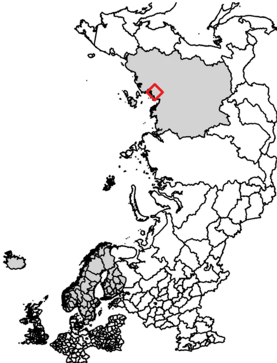
Figure 1. (Continued.)

nucleic acids prior to analysis for pestivirus RNA by real-time RT-PCR. For the extraction, 90 \mu\text{L} of serum was added to separate wells on a 1.2 mL square well storage plate (Thermo AB-1127) together with 10 \mu\text{L} \geq 800 U/mL proteinase K (Sigma-Aldrich, Saint Louis, MO, USA), and run in the extraction robot on a protocol modified for using the kit on the Magnatrix 8000 + . The modification involved an extra post-lysis wash using a 20% dilution of the lysis buffer provided in the kit, and two washes with wash buffers 1 and 2, respectively. Positive and negative controls, which were also used as controls in the real-time RT-PCR, were included in each extraction. All samples were analysed by real-time RT-PCR on the day after extraction.