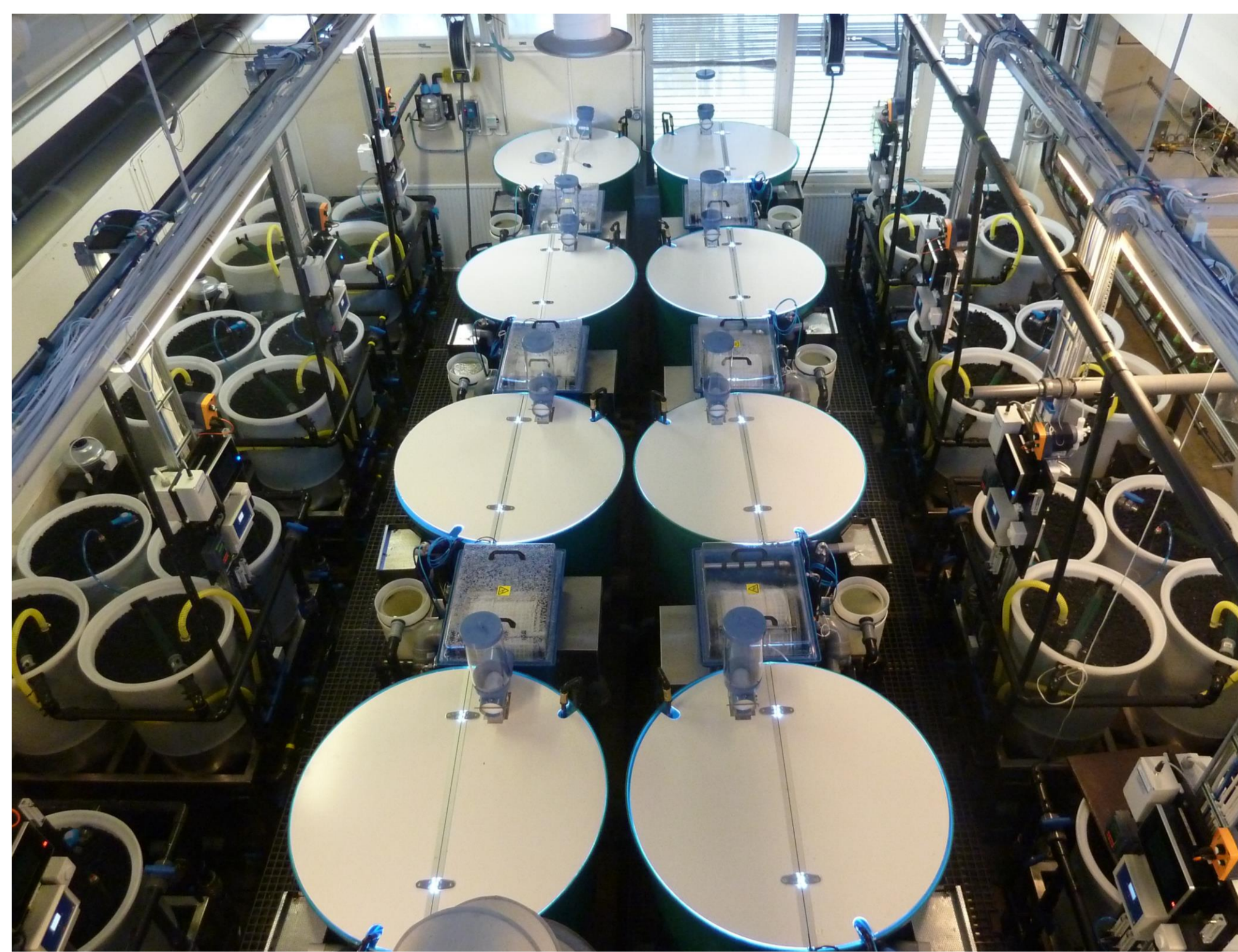
Figure 1. RAS research system used to raise salmonids in central Finland.

Recirculating aquaculture system (RAS) enables reduction in water consumption and nutrient outlet 1 , but unfortunately, has a tendency for the development of off-flavor compounds, mainly geosmin (GSM) and 2-methylisoborneol (MIB), in circulating water and fish flesh. Peracetic acid (PAA, CH 3 COOH), is a strong disinfectant with antimicrobial activity and in aquaculture used to treat pathogens and improve water quality. The aim of this research was to study the effects of PAA addition on GSM and MIB concentrations in rainbow trout fillet and in circulating water.