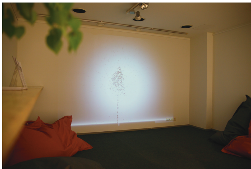
Fig. 2. The projected particle tree in the Interactive Carbon Tree installation in the Science Corner of the University of Helsinki in 2012.

example, the formation of water droplets during weightlessness flights carried out by German Space Agency, trailed along the migration routes of a mysterious Moon Geese, and designed an apparatus that enhances cloud formation.