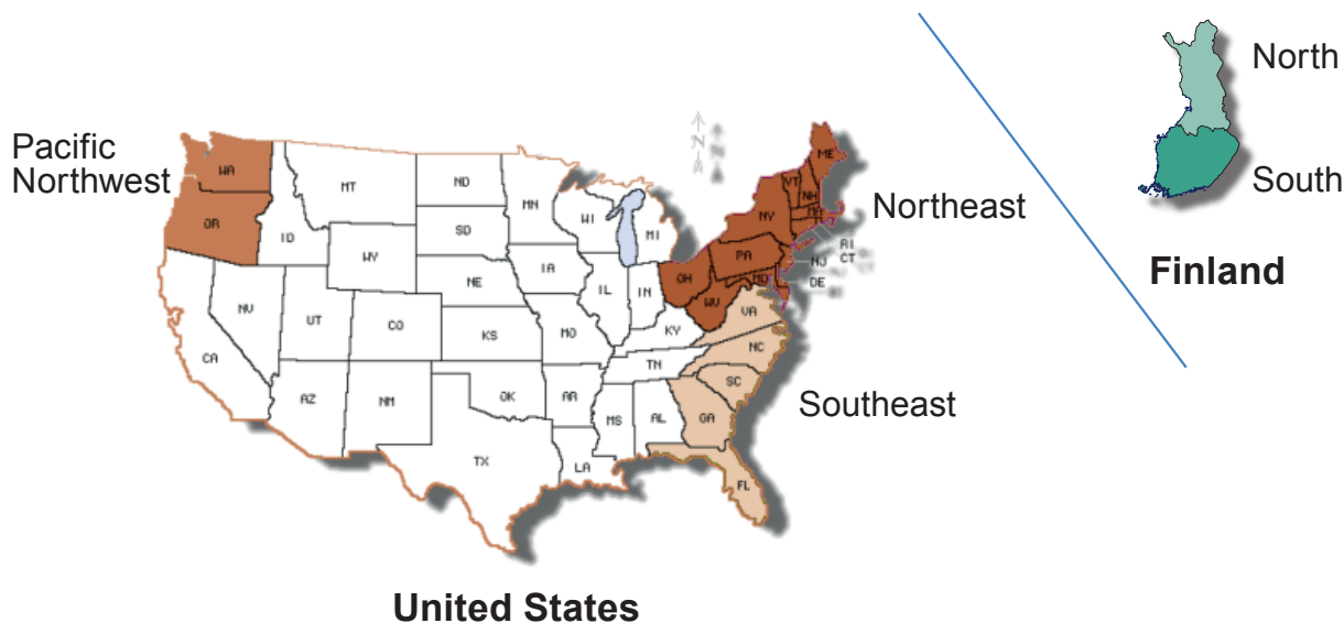
Figure 1. The location of the study regions in the United States and Finland.

been in private ownership since the middle ages. Forests in southern Finland were severely over harvested in the 19th to early 20th century. In northern Finland, the lands are largely state owned. Industrial forest harvests were common in southern Finland through the 20th century, while they rarely occurred in northern Finland before the 1950s.