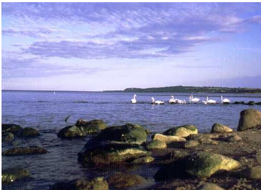
Figure 1. From “Marine Environments Section”: The Baltic coast at Haväng in Skåne.

At present the DPSIR-model is evolving among evaluators and assessment makers. In the “Threats to the Environment’s” section of the SWEIONET, charts or indicators on the state of environment are presented (e.g. Fig. 2, Fig. 3). The selection has been made to fit the present political agenda. Just recently this agenda has been changed from a problem oriented approach with 14 specified threats to the environment, towards a more object oriented evaluational approach. The objectives and the evaluational objects are still under development in the political corridors, but SWEIONET will eventually shift towards the new approach when the political decision is made.